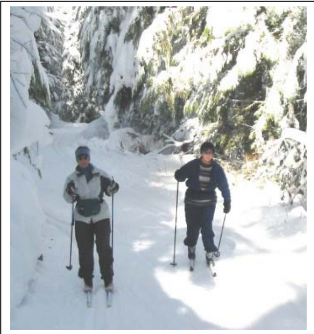
Photo images must be submitted, by 6:00 p.m., Monday, February 23/04, in an envelope marked "Larch Hills Ski Club Photo Contest", with the name, address and phone number of the photographer to appear on each photo image, to: